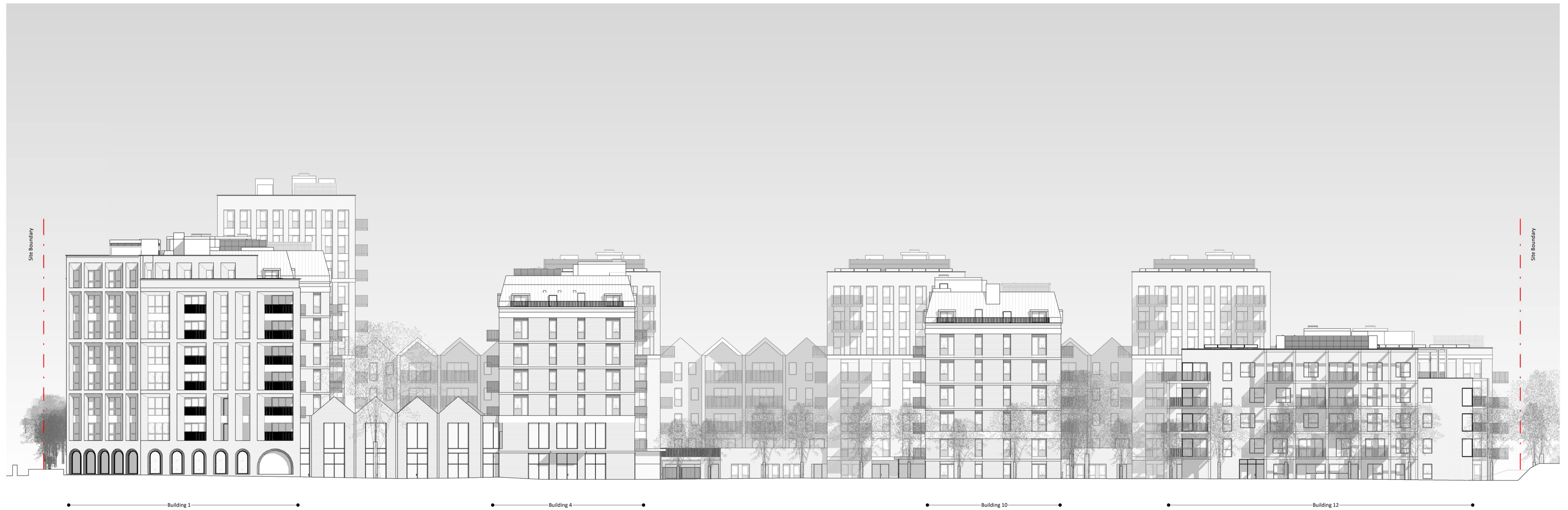
2 Site Elevation - South 1 : 250

NOTES CONSULTANTS - Refer to highways consultant's drawings for details - Refer to landscape consultant's drawings for details - Landscaping layout is indicative only AREAS - Refer to area schedule