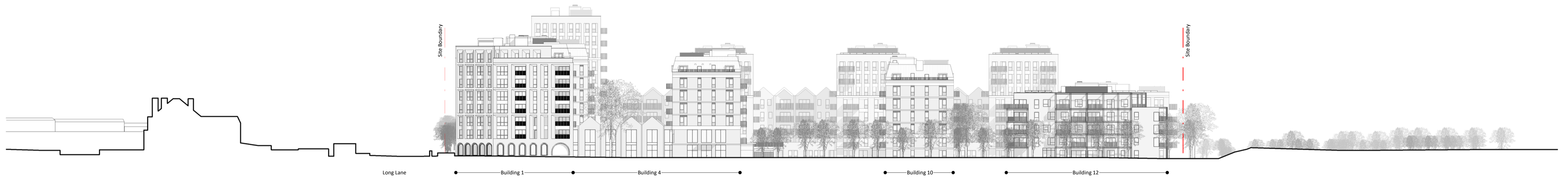
1 Site Elevation - South 1 : 500